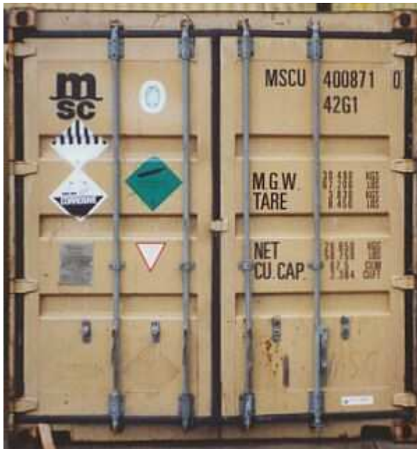
Dangerous cargo container carrying dangerous goods of various classes