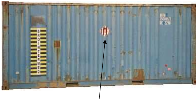
Correct marking on a container side

Example 1. The container is loaded with Class 4.1 flammable solids. (Below)