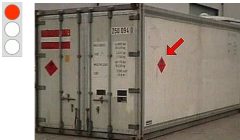
Non-regulation affixing of a placard

Example 3. Wrong positioning of placard since the placards, hazard labels, markings or warning symbols on the outsides of the CTU should not be obscured when the CTU is opened. (Below)